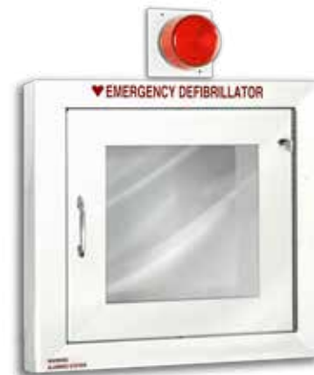
Semi-Recessed Mount Coated Steel Cabinet with Satellite Strobe