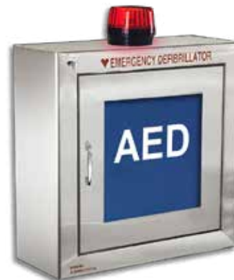
Flush-Mount Stainless Steel Cabinet with Built-in Strobe