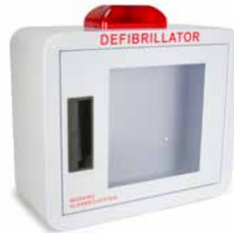
Flush-Mount Coated Steel Cabinet with Built-in Strobe