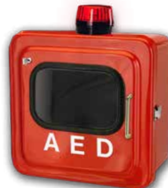
Flush Mount Fiberglass Cabinet with Built-in Strobe